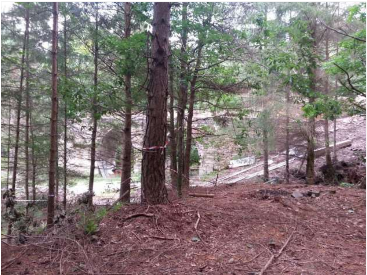
View of area A2 standing on top of the culvert looking towards the arches