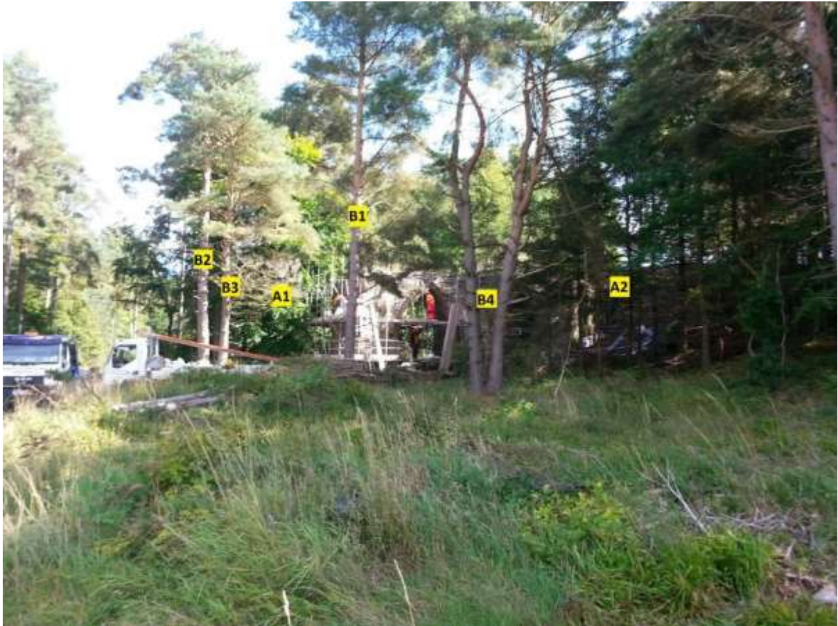
View of site from the west. Vans are parked on the trackway & footpaths. NB Scaffolding and other works will no longer be on site