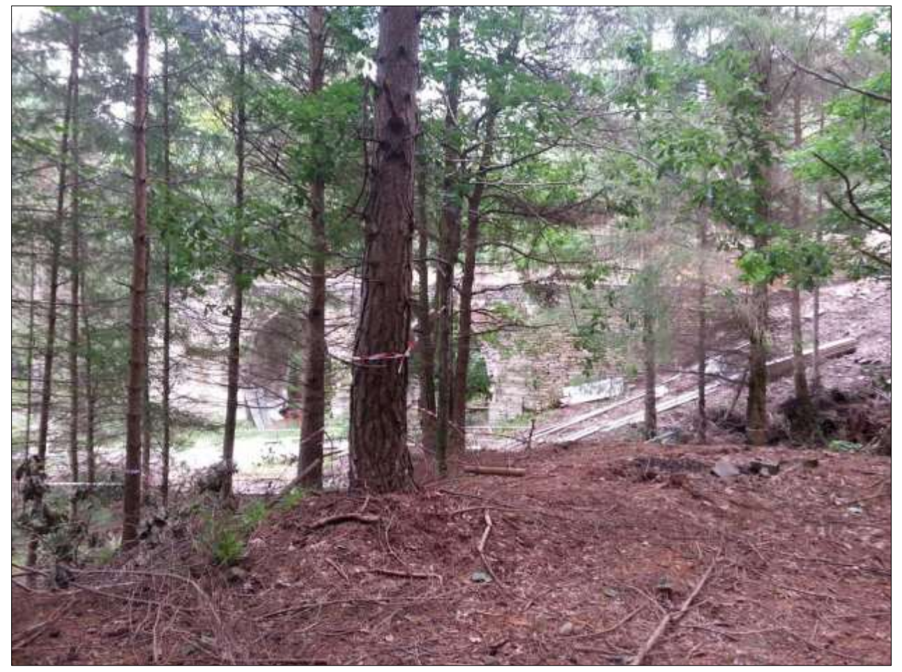
View of area A2 standing on top of the culvert looking towards the arches