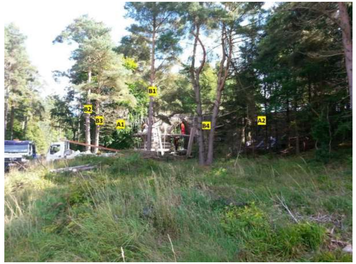
View of site from the west. Vans are parked on the trackway & footpaths. NB Scaffolding and other works will no longer be on site